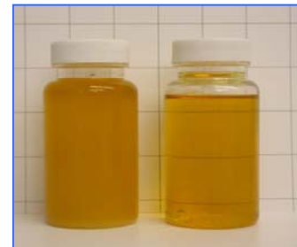
Verify water concentration in PPM. Left Sample has 1600 PPM Right Sample has 50 PPM