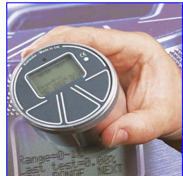
Hand Held LCD Tester