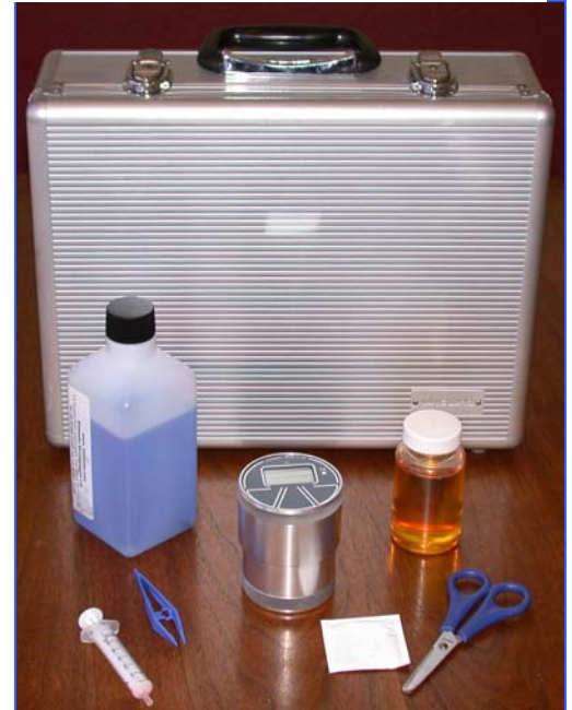
WATER ANALYSIS TEST KIT

For information & technical support help, call us at 830-816-3332 or toll free @ 800-449-0262